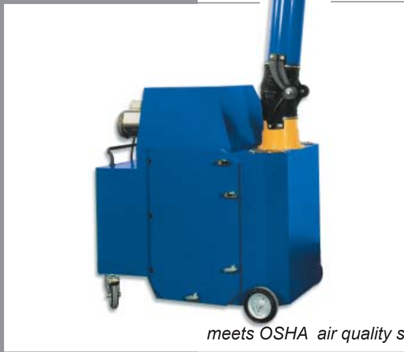
meets OSHA air quality standards

Welding Fumes Grinding Dusts Dry Dusts Soldering Dusts Powders And more